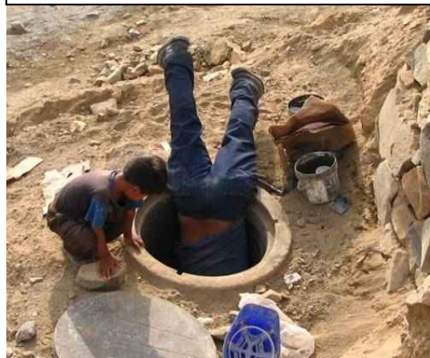
Couldn't resist this photo! Not the recommended way to examine your drainage system!