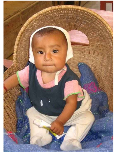
One of the many lively La Campiña babies!

Sunday 2 nd Kings Heath Evan, Highbury Road, 10.30 am.