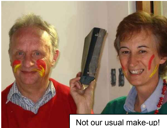
Not our usual make-up!

Telephone 0121 783 8637. If you have problems contacting us our prayer secretary Iris Aylin 0121 704 4721 can help. Our e.mail when connected will remain the same.